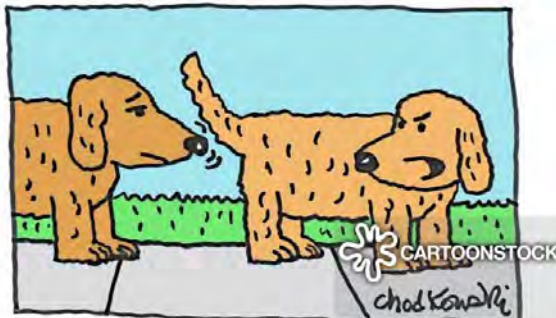
"What part of 'social distancing' don't you understand?"